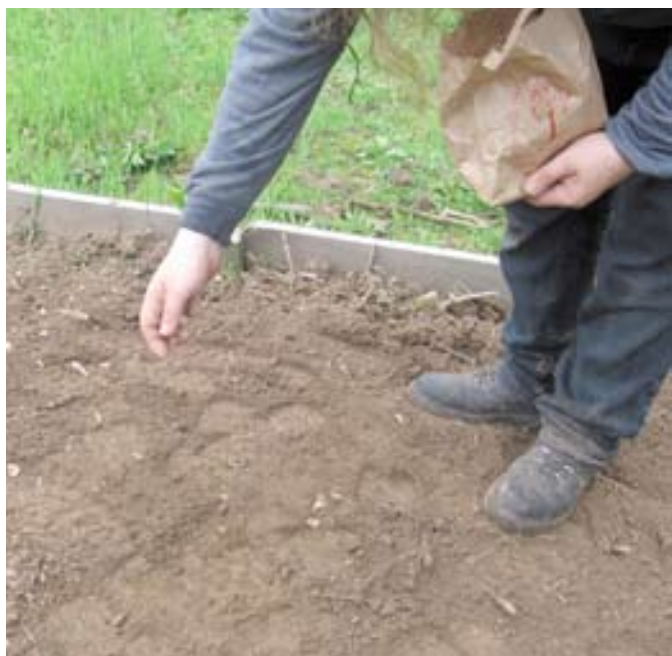
sowing seeds at the tree nursery . .