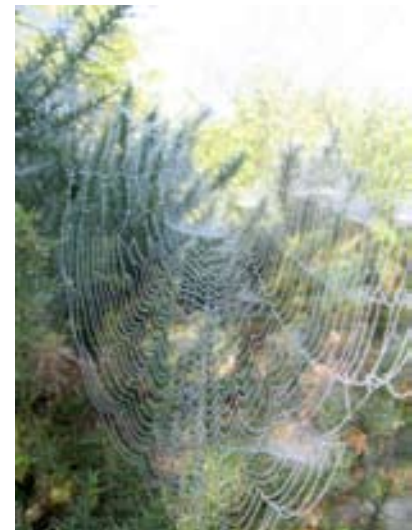
early morning dew reveals the web . .