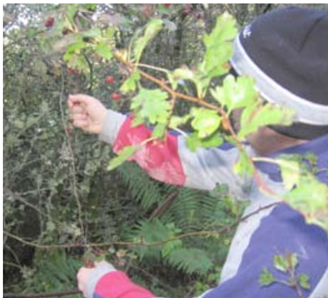
collecting hawthorn seed . .

And not forgetting Lochgilphead Resource Centre and ASET, and several Hospital patients, who worked so hard sifting and sorting the lying bulks of the felled trees, and working with us to ensure their off-spring.