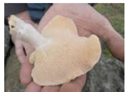
A hedgehog mushroom . .