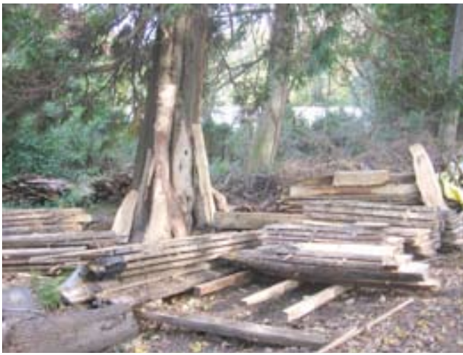
the sawn timber accumulates in the yard