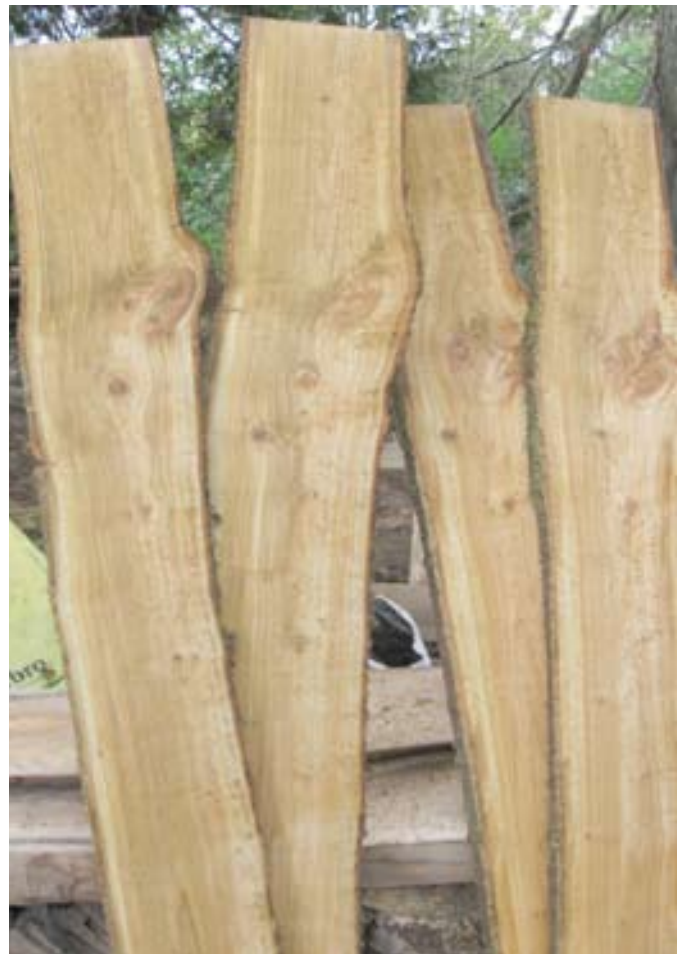
rowan berries stored for germination . . some of our lovely planks . .