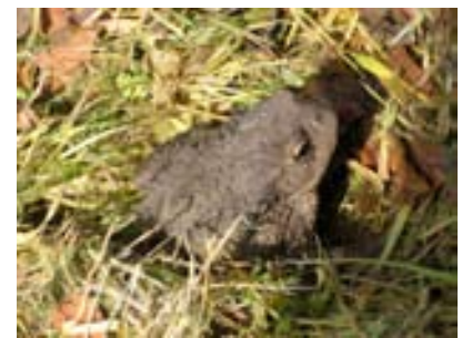
off to Toad Hall . .