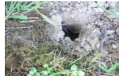
a mouse hole . .