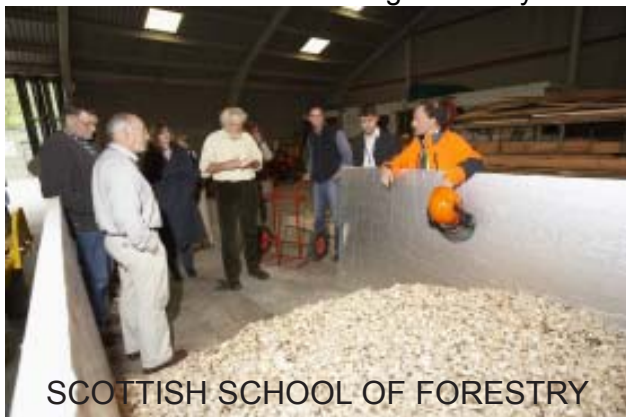
SCOTTISH SCHOOL OF FORESTRY

The session was rounded up by two more presentations from Forest Research – each addressing different harvesting issues that have arisen through increasing demand for woodfuel, and discussing ways to maximise both the biomass yield and nutrient retention through forestry based