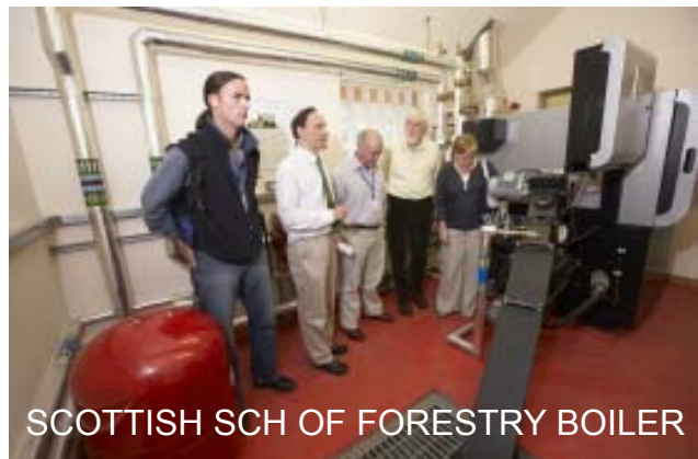
SCOTTISH SCH OF FORESTRY BOILER

Following this, Karri Passanen of the Finnish Forest Research Institute (METLA), talked about 'EnerTree', a decision support tool for evaluating economical and ecological consequences of forest biomass extraction. Forest Research and METLA