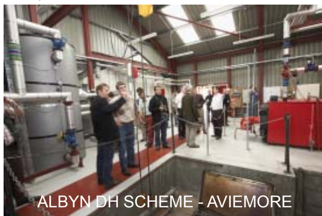
ALBYN DH SCHEME - AVIEMORE

The range of topics covered at the conference gave a good reflection of how quickly Scotland's woodfuel sector is growing. Whilst this is very positive on the whole, it is clear that there are still plenty of challenges to be addressed. In particular, it was striking that when Northern WoodHeat launched three years ago, attention was focussed on how plentiful the potential woodfuel supply in Scotland was and what a good opportunity it posed. However, we heard from several different speakers that now the focus is on sourcing enough supply to meet the projected demand arising from a number of large scale biomass developments, for which there is currently a predicted shortfall. At the small and medium scale however, in rural areas too far away to supply such large scale projects, there are still significant opportunities for development. Displacement (competition for resources with other wood processing sectors) was also a hot topic, and Roger Coppock's talk outlined how the Woodfuel Task Force for Scotland is seeking to address this by focusing on waste wood, agricultural waste-streams and small under-managed woodlands. Other issues that recurred throughout the week were the high capital costs of woodfuel installations in comparison to other fuel sources, the shortage of qualified woodfuel boiler installers and woodfuel quality issues.